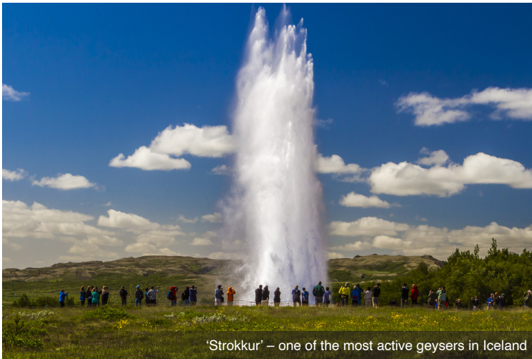
'Strokkur' – one of the most active geysers in Iceland

Enjoy free time for lunch on your own and shopping, then prepare to “take off” as you visit FlyOver Iceland. During this virtual flight, experience waterfalls, geysers, scenic landscapes, and the spectacular natural wonders of Iceland like never before. With the special effects of motion, wind, sound and scents, this unique “flying” experience is sure to be a highlight of your day! Return to the hotel late afternoon for an evening at leisure. Meal: B