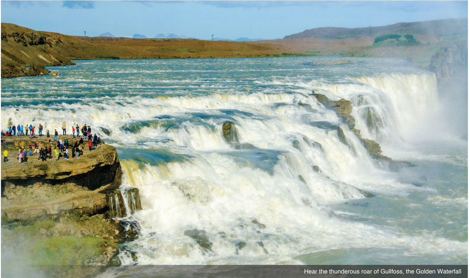
Hear the thunderous roar of Gullfoss, the Golden Waterfall