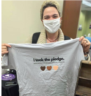
During spring semester 2021, the Office of Student Life gave MGA students, staff, and faculty opportunities to formally pledge to listen to the stories of others, treat all people with dignity and respect, and commit to fostering an inclusive learning environment.

In response to the wave of social movements and protests that followed the violent deaths of Ahmaud Arbery, Breonna Taylor, and George Floyd in 2020, Middle Georgia State University placed a renewed emphasis on diversity, inclusion, and equity-related programs at the institution.